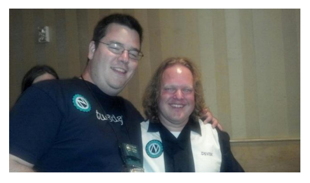
... and here is the after picture, ha ha.