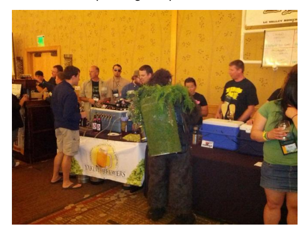
Fancy serving bar