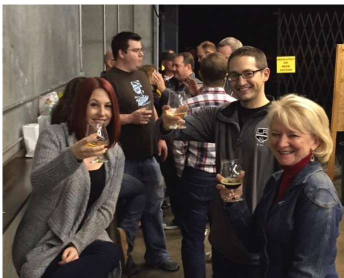
The February Final Friday was at Smog City Brewing Co. Cheers!