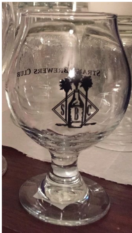
Strand Brewers Club Belgian Tulip.

to the February meeting. Look for them in March.