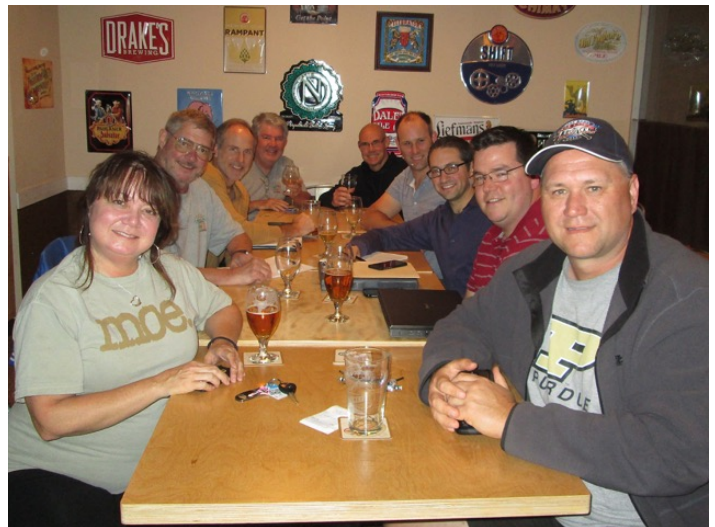
The 2015 PBC Organizing Committee.