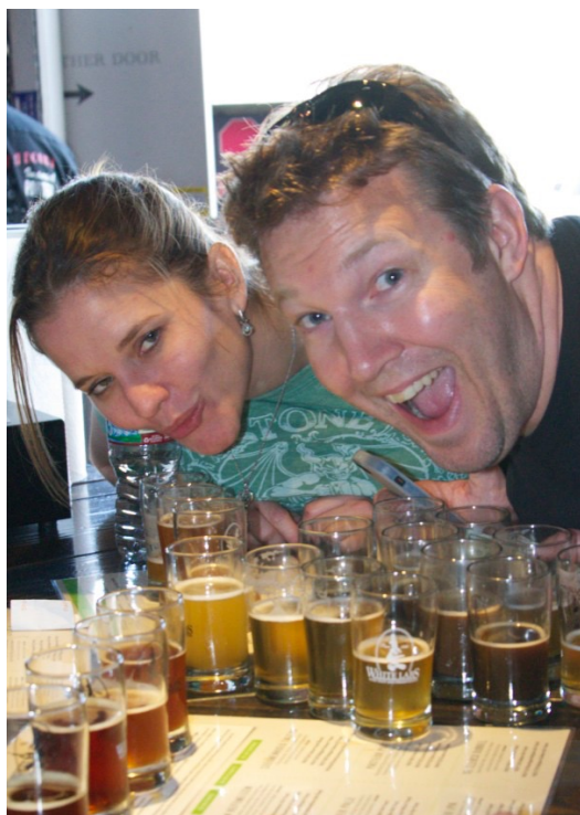
Beer Touristas on the Strand Brewers Club 2014 AHA Rally at Stone Tour.

October 14, 2015 Club Meeting Ingredients: Palisade Hops, Crystal Malt, and Ginger