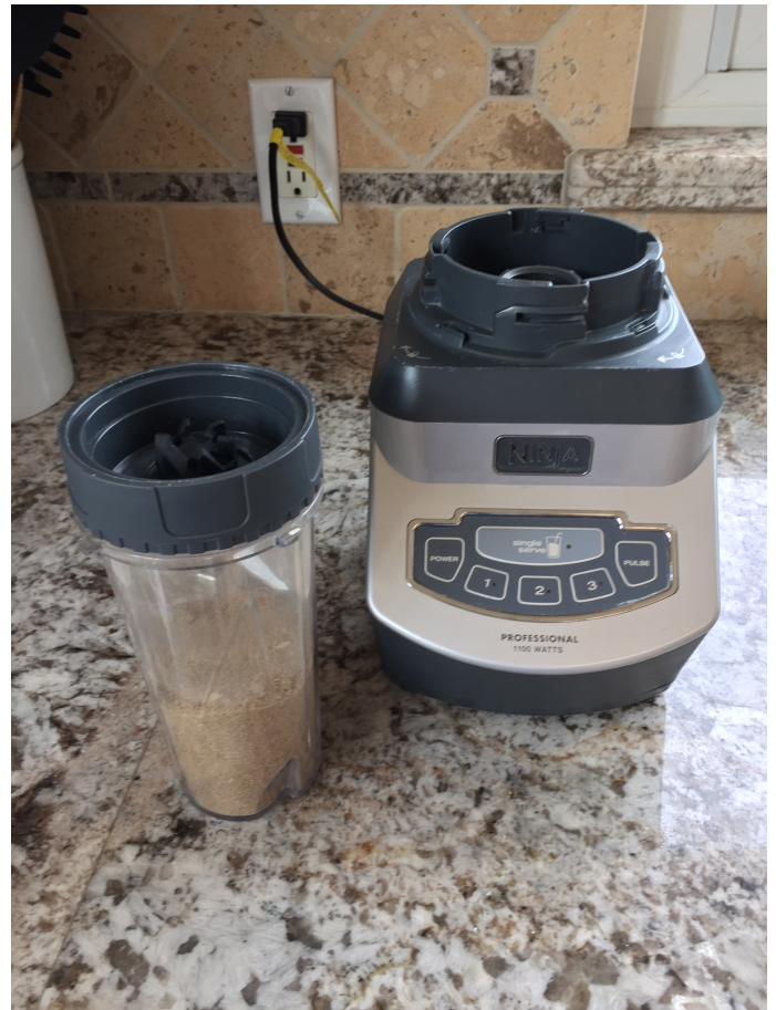
Blades of the Ninja make a fine flour.

I started baking with spent grain because I was dumping a lot of grain into the green waste bin. It struck me as wasteful. So I began seeking out recipes and experimenting. One of my discoveries is that if you can mill the spent grain fine enough, you can use it in place of the flour in just about any recipe. I currently use my Ninja blender to make flour. It makes a flour that is much more fine than the flour I made with a coffee/spice grinder.