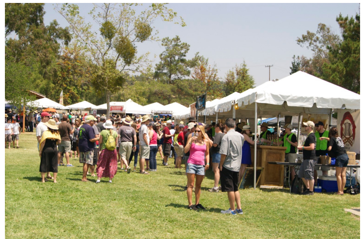
2013 Southern California Homebrewers Festival.

It is our policy to brew and consume beer strictly for fun. Under no circumstances does the Strand Brewers Club support or condone, in any manner, the violation of any law, including the sale or barter of homebrewed beer, the operation of a motor vehicle under the influence of alcohol by a member or a participant in any club event, or the provision of alcohol to minors.