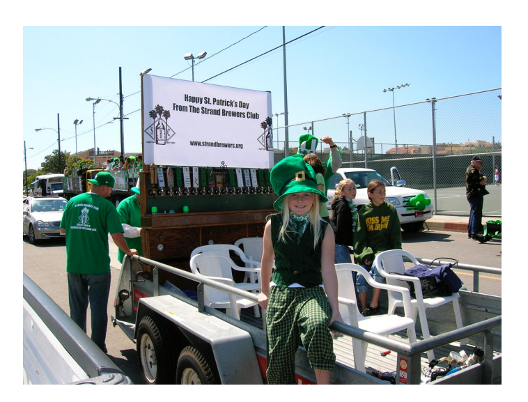
The Strand Brewers' bar was in the parades.