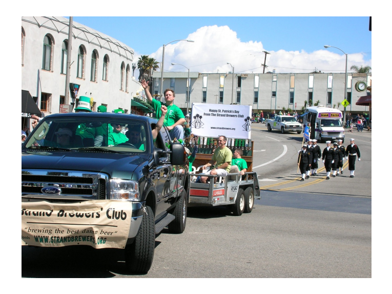
Strand Brewers Club on parade.