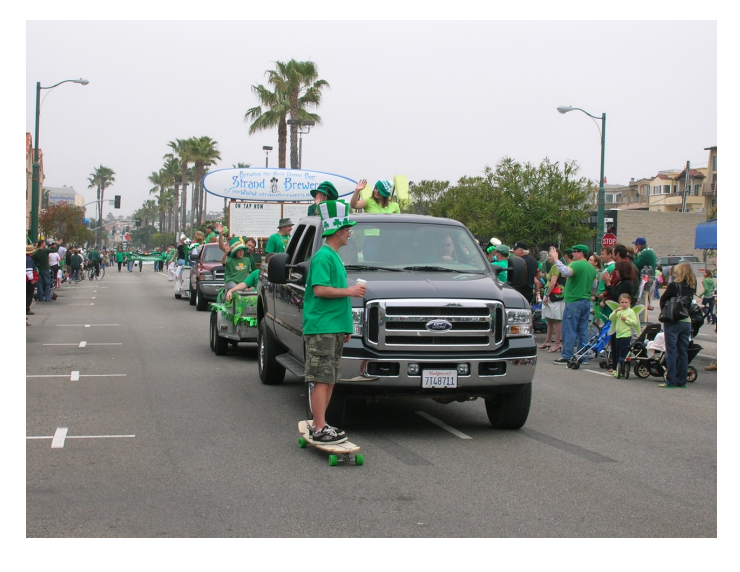
And so was the Strand Brewers' surf board.

Then in 2008 the Hermosa Parade Committee banned all beer-related groups from marching in the event. Rumor has it, however, that ever since then somehow the Strand Brewers club was still able to find beer and homebrew to enjoy on St. Patrick's Day.