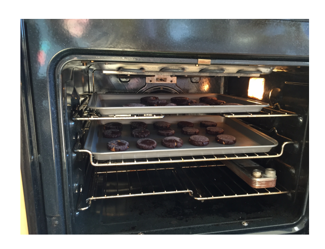
When I remember, I put my plate chiller in the oven during baking so that it is disinfected.

Bake at 350 degrees for about 8 minutes or just until set and slightly cracked. Cool on cookie sheet for 1 minute. Transfer to a wire rack, cool. If there are any left after you are done letting them cool, put them in an airtight container.