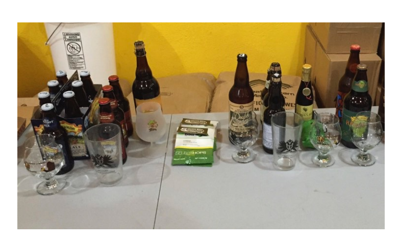
Prizes! Prizes! Raffle Prizes! Remember to buy tickets to win at the meetings.

It is our policy to brew and consume beer strictly for fun. Under no circumstances does the Strand Brewers Club support or condone, in any manner, the violation of any law, including the sale or barter of homebrewed beer, the operation of a motor vehicle under the influence of alcohol by a member or a participant in any club event, or the provision of alcohol to minors.