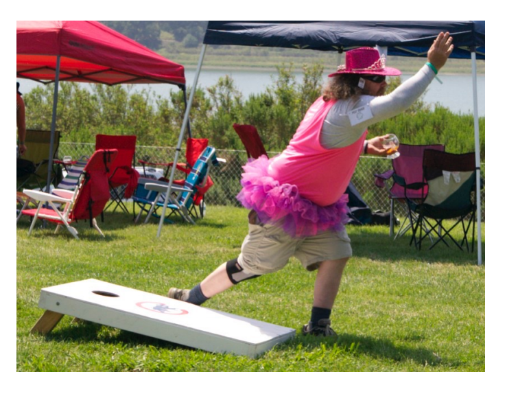
You'll meet the most interesting people at the Southern California Homebrewers Festival.

must be a <u>California Homebrewers Association</u> member to attend ($10) and there is an additional fee to attend the festival ($35 until registration is closed on April 17<sup>th</sup>). Buy your tickets for the 2015 SCHF before it is sold out.