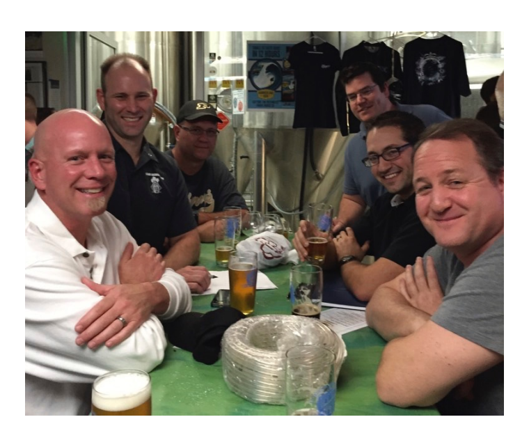
Officers meeting at El Segundo Brewery.