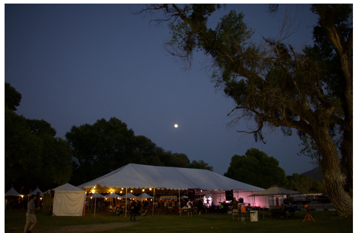
Rockin the tent at the 2015 SCHF.

It is our policy to brew and consume beer strictly for fun. Under no circumstances does the Strand Brewers Club support or condone, in any manner, the violation of any law, including the sale or barter of homebrewed beer, the operation of a motor vehicle under the influence of alcohol by a member or a participant in any club event, or the provision of alcohol to minors.