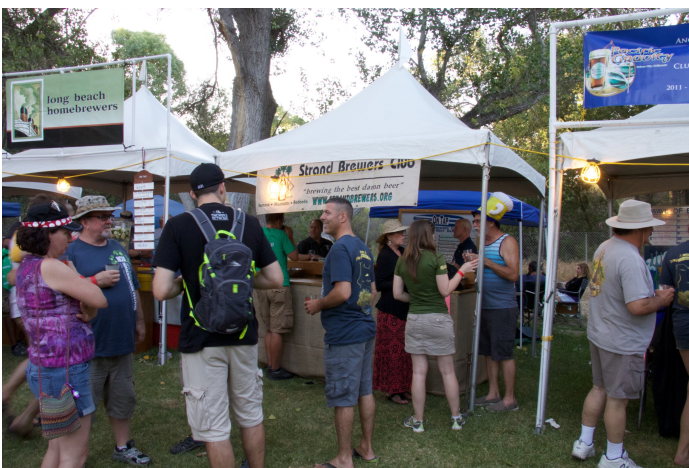
There was a line at the Strand Brewers Club bar.