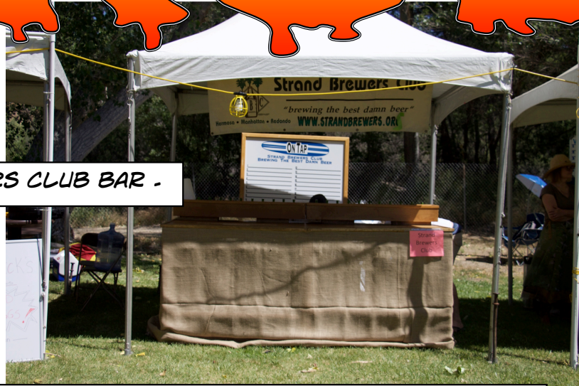
THE STRAND BREWERS CLUB BAR .

WAS IT THE LAST CLUB BAR TO BE DISMANTLED AT THE 2015 SOUTHERN CALIFORNIA HOME BREWERS FESTIVAL?