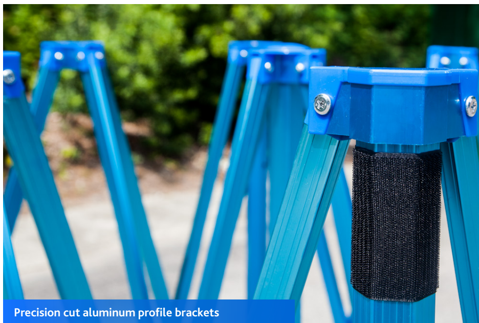
Precision cut aluminum profile brackets