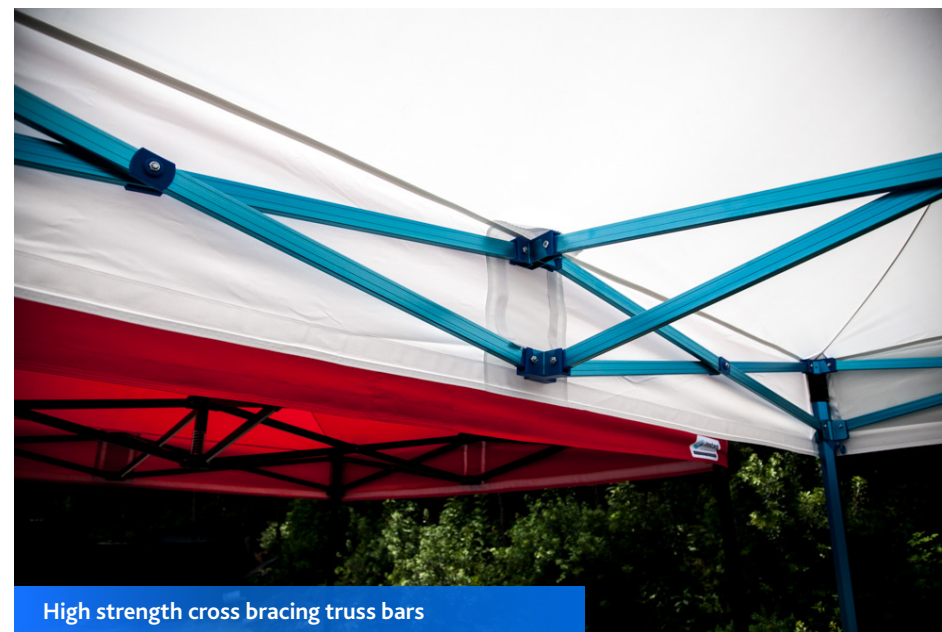
High strength cross bracing truss bars