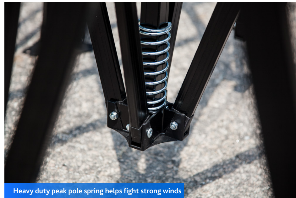
Heavy duty peak pole spring helps fight strong winds