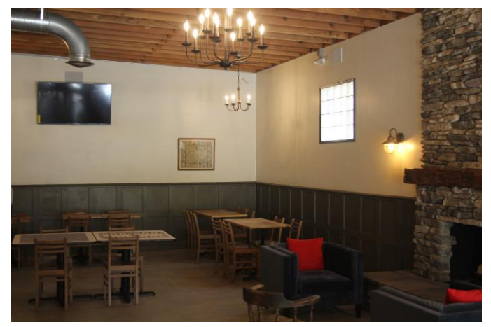
Tasting Room Interior