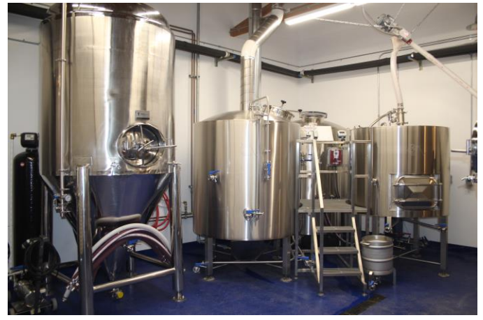
The Yorkshire Square Brewery

Yorkshire Square will open with 8 hand pumps and space for more. The 10 barrel brewery has two 20 barrel fermenters and one 10 barrel fermenter purchased from Refuge Brewing in Temecula. With a kitchen on site the brewery will eventually offer food and can feature guest beers. The brewery has a bright open interior, lots of outdoor seating, and plenty of parking. They eventually plan to open for football games (with the round ball) when Liverpool is playing since Andy is a fan, but it is unlikely they will open for other teams like the Spurs, much to Jill Updyke's dismay. Yorkshire Square is an exciting new addition to the South Bay breweries.