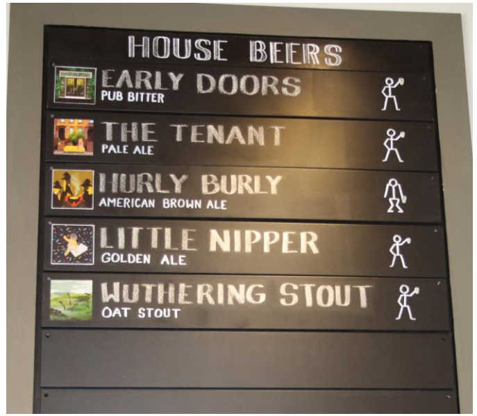
Beers of Yorkshire Square

I have always enjoyed English beers for their great flavor and drinkability, lower alcohol, and rich mouthfeel from the low carbonation. Yorkshire Square did not disappoint. Early Doors is a bitter at 3.6% ABV. It features a rich malt backbone and a pleasant bitterness in the finish. The Tenant is a pale ale at 4.3% ABV. It has less malt flavor and more hops than Early Doors. The hops are earthy English hops and the beers is delicious. Wuthering Stout is a 4.8% ABV stout featuring roast and dark malt flavors. The remaining two beers that will be on tap on April 19th included dry hopping and needed additional time for the beer to clarify. While I have included the ABV of the beers the brewery has a unique method of labeling the strength of the beers to encourage patrons to try the beer based on flavor rather than alcohol content. The figure below shows stick figure representing beers under 5% ABV and beers between 5% and 7 % ABV.