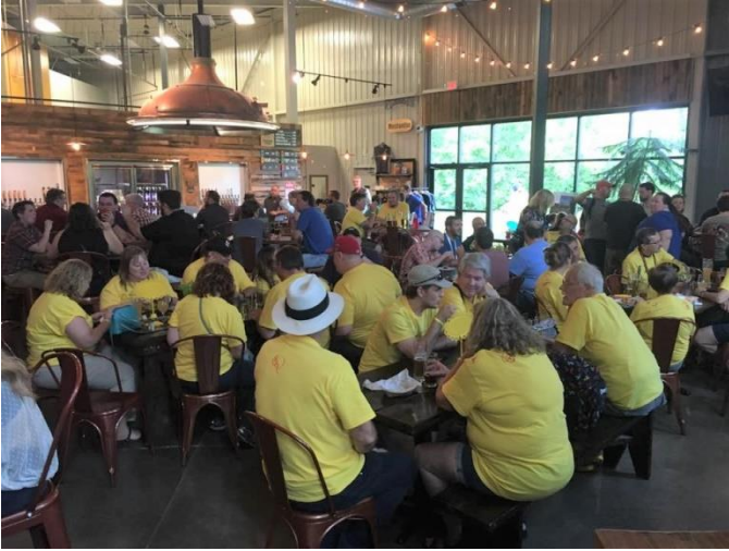
Utepils' grand room

them. The best part of the day was visiting with different people. Everyone was friendly and we always felt comfortable in conversation.