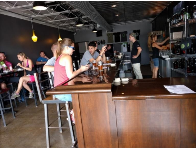
Steel Toe hosted the best conversations