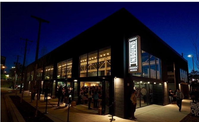
Inbound's room was beautiful and was a fitting, dog friendly end to the day

This was my first NHC in a convention center. Initially, I wasn't thrilled with the concept but our hotel was only two blocks away and the MCC did have big rooms. Apparently this is a view of the future. Attendance was 2,000; lower than recent NHCs.