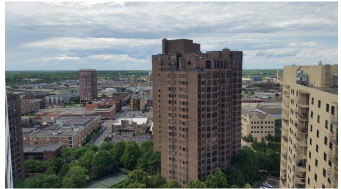
A view of flatland from our hotel room.

My buddy Bill Frith and I went to the NHC last month. The flight was uneventful and Minneapolis's Blue Line train made it convenient to travel the last 7 miles from airport to city center for only 75¢. Pay attention LA!