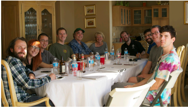
Scottish and Irish Ales Tasting Session.

BJCP Tasting Exam Sessions. We will be organizing tasting sessions throughout the year in preparation for the exam. Those signed up for the test are encouraged to join. Please email me ( millstadt@gmail.com ) with a list of BJCP categories and/or subcategories that you are interested in.