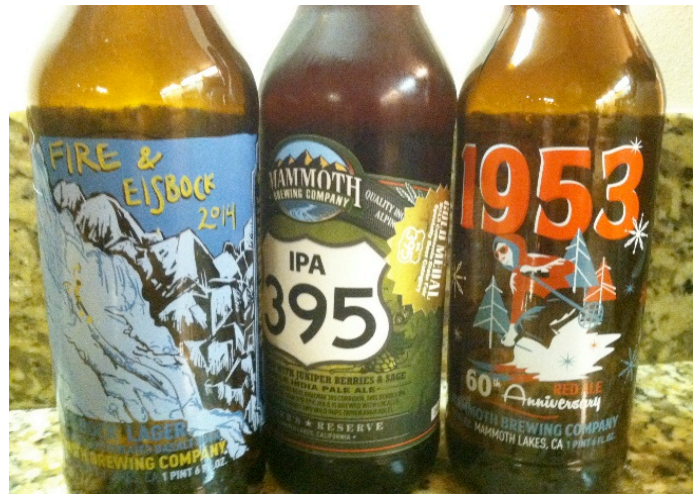
Mammoth Brewing Company beers.

In late February I managed to make a trip up to Bishop, CA. In addition to the great rock climbing Bishop offers, I always enjoy the Mammoth beers that can be found around town.