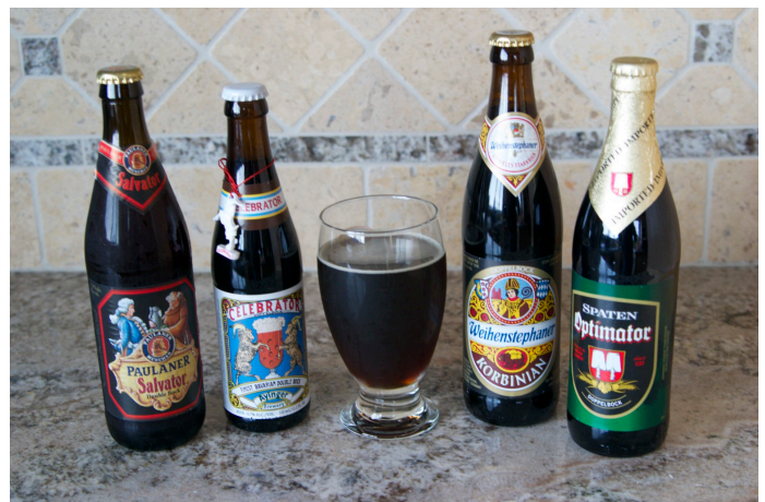
My flawed doppelbock and commercial doppelbock examples.