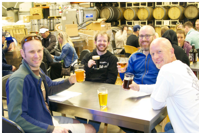
Club Officers hard at work. And that lone beer on the table would be mine, The Dregs Editor.

At each club meeting the homebrewer that brings the beer judged by the members to be the best wins first choice of the raffle prizes!