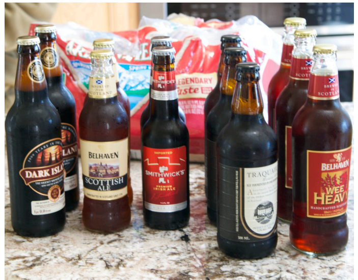
Scottish and Irish Ales at the Tasting Session.

It is our policy to brew and consume beer strictly for fun. Under no circumstances does the Strand Brewers Club support or condone, in any manner, the violation of any law, including the sale or barter of homebrewed beer, the operation of a motor vehicle under the influence of alcohol by a member or a participant in any club event, or the provision of alcohol to minors.