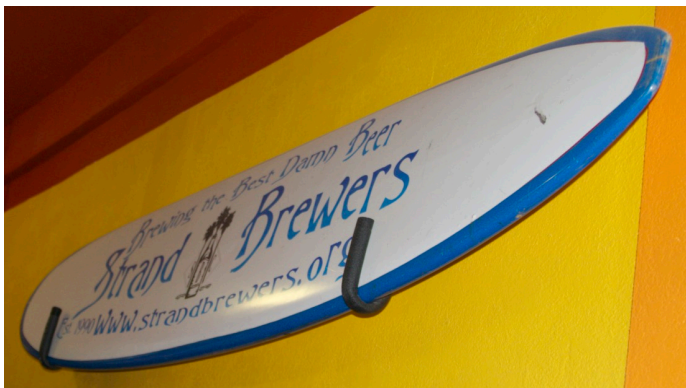
"Brewing the Best Damn Beer!"

Link to the Calendar for Strand Brewers Club Events.