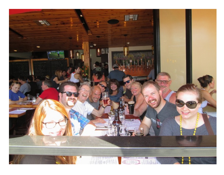
At the beginning of the 2014 BBB . . .

The 2014 BBB...was held on August 23<sup>rd</sup>. We started at Simzy's in Manhattan Beach and it went south from there. A great time was had by all!