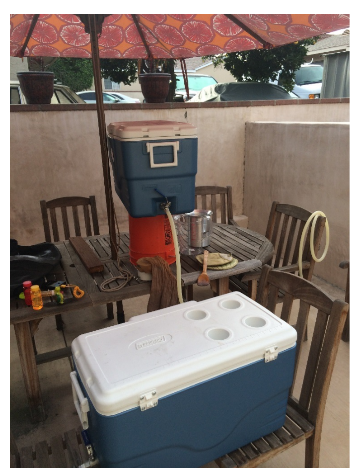
Lautering over Labor Day.

With September starting I have a new kindergartener in the house and I know I am not the only one in the club with kids heading back to school. With my Dregs article already late I decided to brew a quick batch of beer over the Labor Day weekend to celebrate the start of school and the long weekend. I was