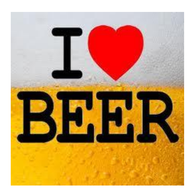
Just not this crap!