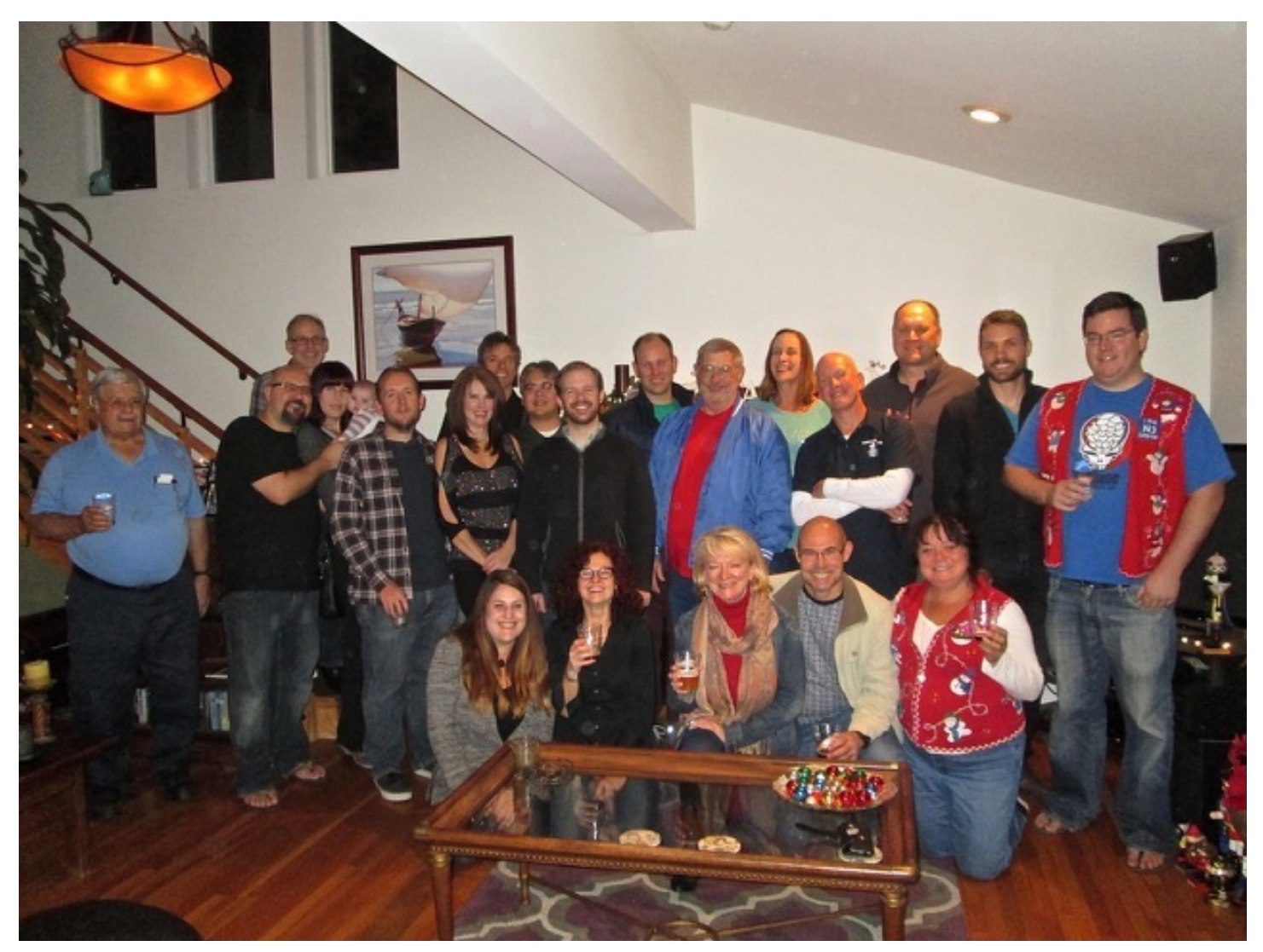
The 2015 Strand Brewers Club Holiday Party.

It is our policy to brew and consume beer strictly for fun. Under no circumstances does the Strand Brewers Club support or condone, in any manner, the violation of any law, including the sale or barter of homebrewed beer, the operation of a motor vehicle under the influence of alcohol by a member or a participant in any club event, or the provision of alcohol to minors.